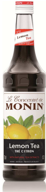
Tea concentrate 5 flavours