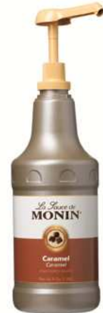
Sauces 3 flavors