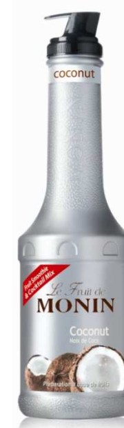
Le Fruit de MONIN 8 flavors