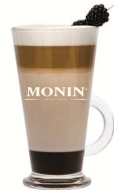
Mocha (MONIN Chocolate Sauce, Coffee and froth milk)