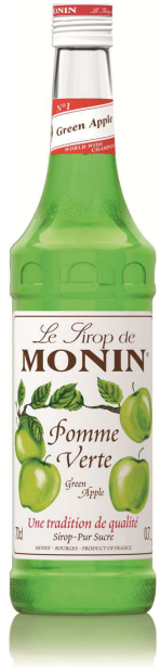
Syrups over than 100 flavours