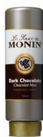
Topping sauce 3 flavors