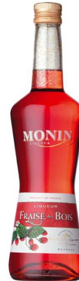
Liqueurs over than 20 flavors