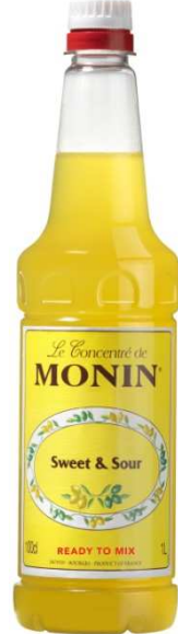
Bar mixer Together with cordial, bitter...